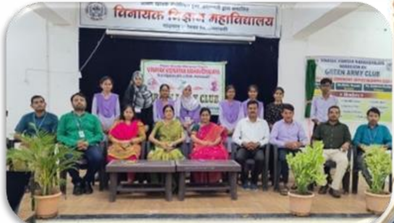
Inauguration of GREEN ARMY CLUB 2025-26