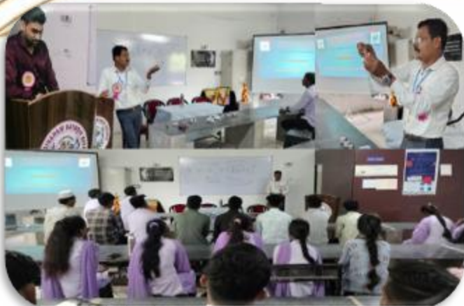
Department of Physics Organized One Day Workshop on Design and Fabrication of Power Supply