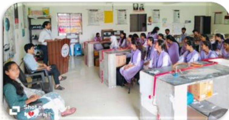
Department of Chemistry celebrated World Ozone Day by organizing Chemi Quiz Competition.