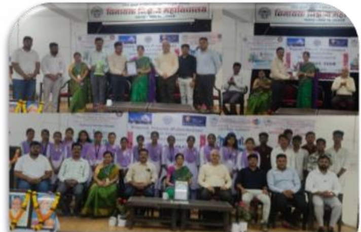
Installation Ceremony of Heritage Club 2025-26