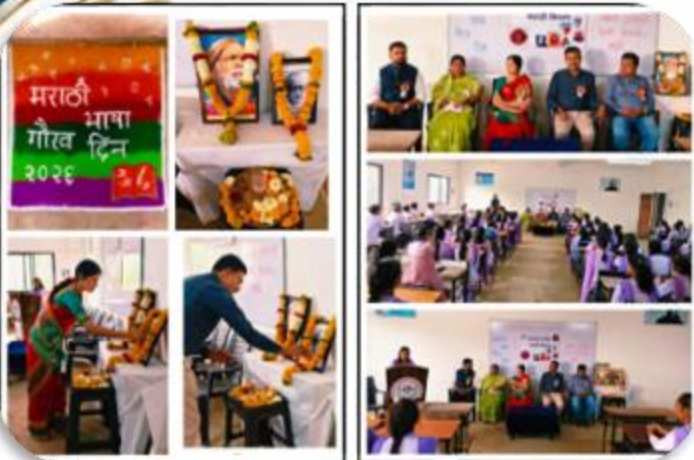
Language department Celebrated Marathi Bhasha Gaurav Din 2026