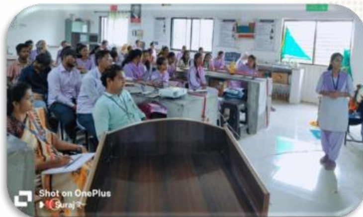
Department of Chemistry Celebrated National Chemistry Day by organizing Interclass Seminar Competition