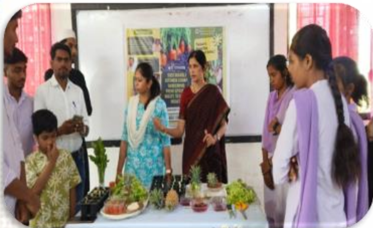
Hand- on training at One Day Workshop on Kitchen Gardening