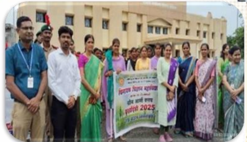
Environment Awareness Rally: VRUKSHA DINDI