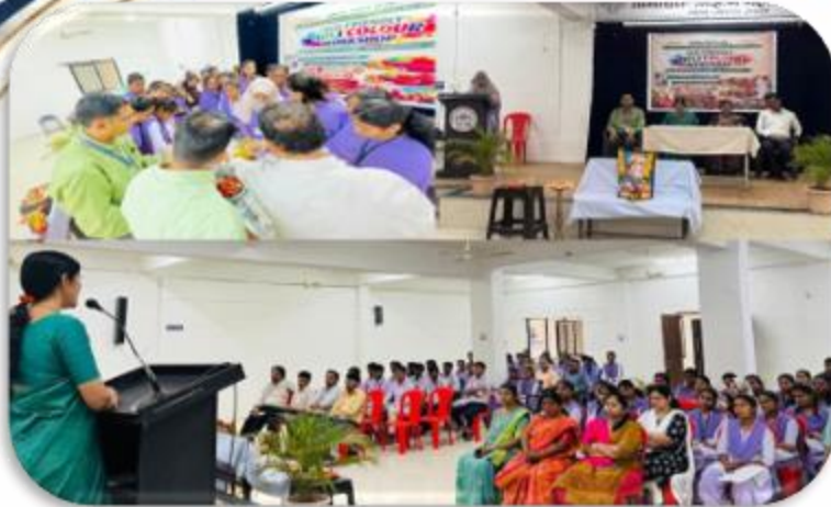
Eco -friendly Holi Colour Workshop Organized by Green Army Club