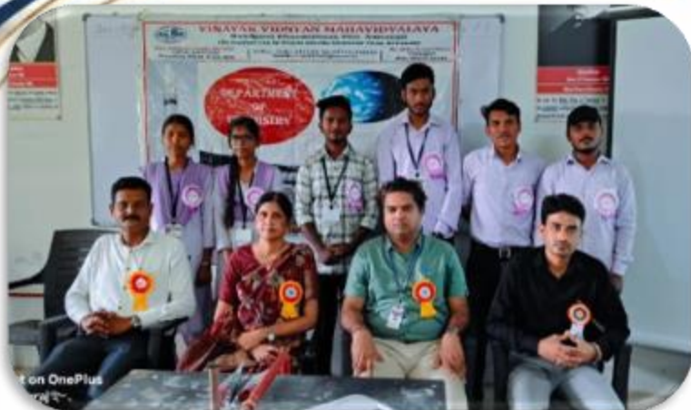
Department of Chemistry inaugurated Chemical Society for the session 2025-26.