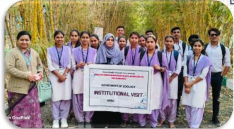
Visit to Bamboo Garden Dept.Of Zoology B.SC III