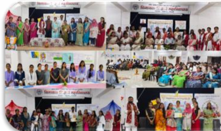
Celebration of Navratri Utsav–2025: “Jagar Stri Shakticha”, organized by Womens Cell