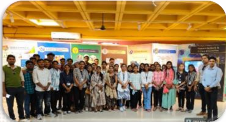
Educational Tour at Raman Science Centre, Nagpur was organized.