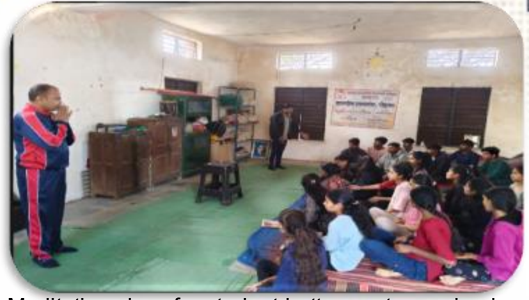
Meditation class for student betterment organised by department of Commerce at gram Rohna