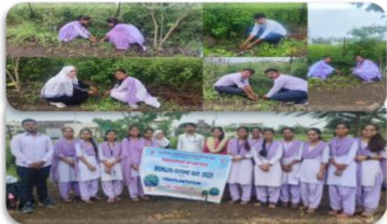
Students of B.Sc. and Teachers of Department of Botany are planting Trees in college campus