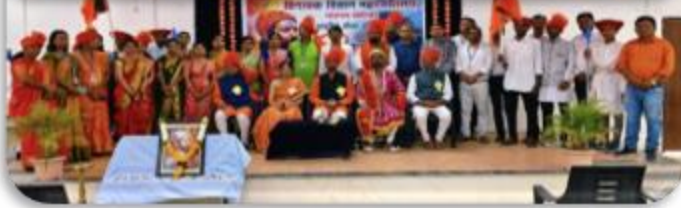
राष्ट्रीय सेवा योजना तर्फे छत्रपती शिवाजी महाराज जयंती