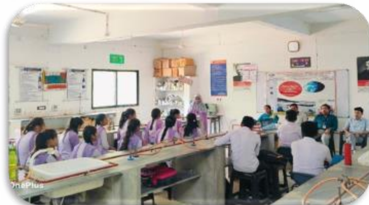
Department of Chemistry had organized Guest Lecture on Bioinorganic Chemistry for BSc Part III