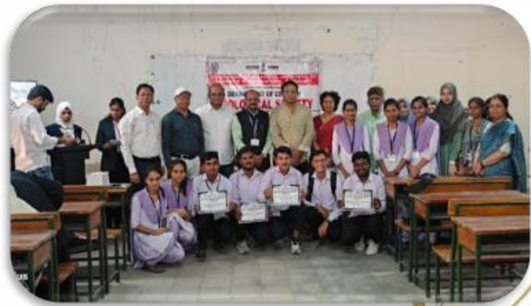
State Level Bio-genius Quiz Competition at G.V.I.S.H,