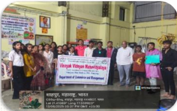
Industrial visit at spoorthi Processing unit Shahapur District Chikhaldara