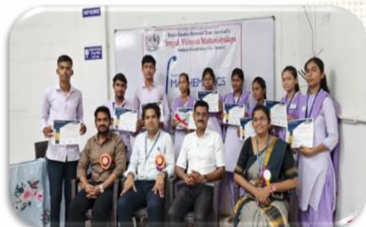
Inauguration of Mathematics Society along with Seminar Competition on 20 th August 2025.