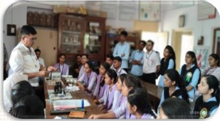
Workshop on Microtechnique at Dhamangaon Railway an academic exchange program under MoU