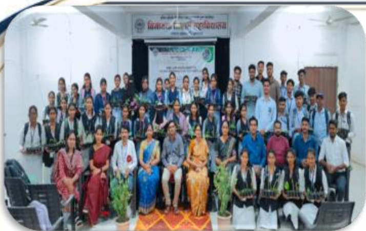
Guest of honor, Students of B.Sc. and Teachers of Department of Botany of various colleges present on One Day Workshop on Plant Propagation Techniques