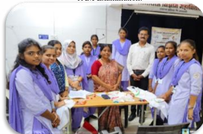
The Women Cell also conducted a Certificate Course on Embroidery.