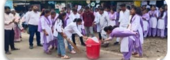
नांदगाव खंडेश्वर बस स्टँड येथे स्वच्छता अभियान राबविण्यात आले