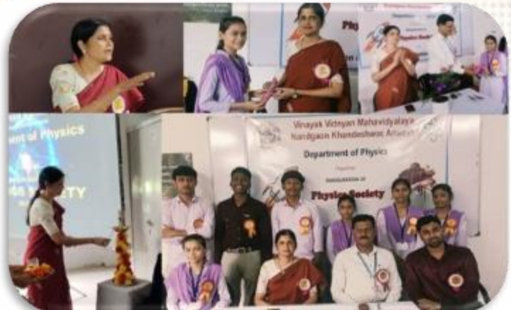
Inauguration of Physics Society 2025-26 and Celebration of National Space Day