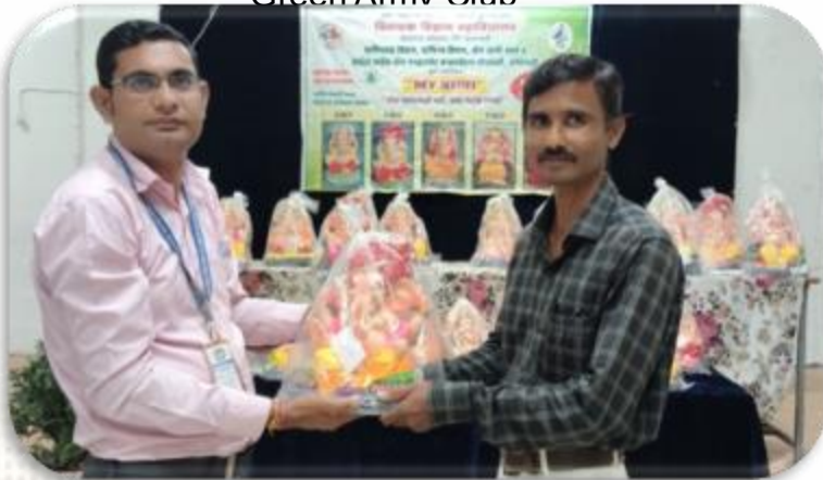
"MY BAPPA" Department of Zoology , Green Army Club and WECS joint activity to promote use of Clay Ganesh Idol.