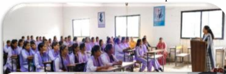
Guidance Lecture on Prevention of Sexual Harassment of Women at Workplace