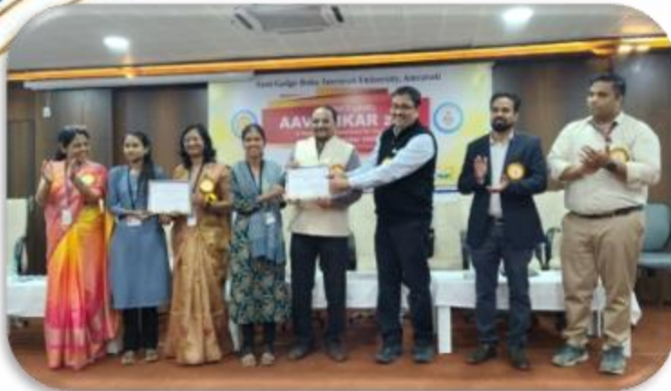
Students of department of Chemistry achieve First Rank in District Level AVISHKAR Competition