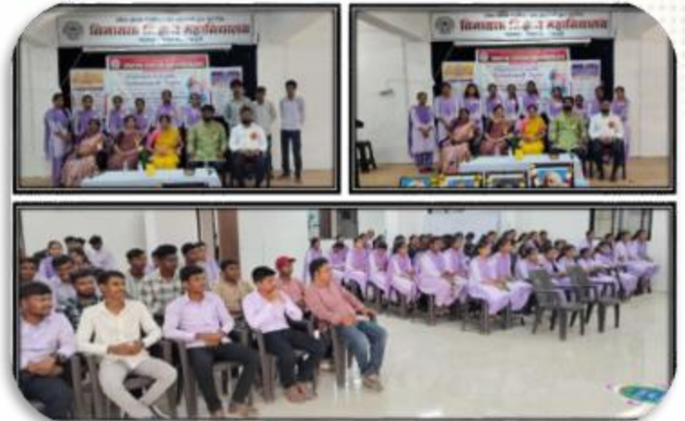
Inauguration of Language Club 2025-26