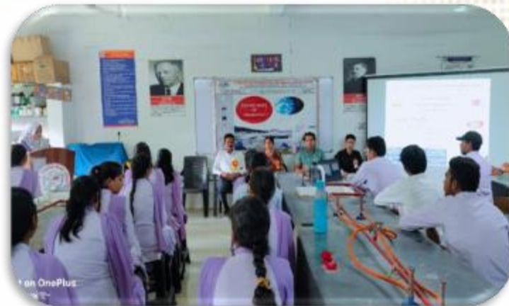
Department of Chemistry organized one day workshop on JAM Examination.