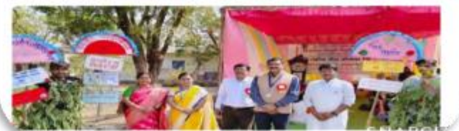
राष्ट्रीय सेवा योजना (NSS) तर्फे विशेष श्रम संस्कर शिबिर रोहना येथे आयोजित करण्यात आले