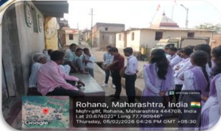
Financial literacy Program Organised by Department of Commerce at gram Rohana